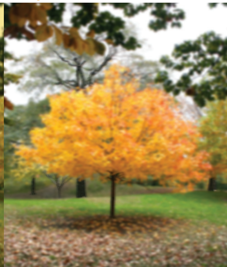
Simulated vision with a monofocal IOL and astigmatism