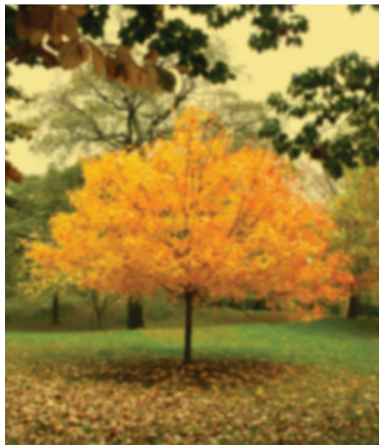
Simulated vision with cataracts and astigmatism